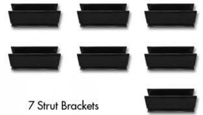
7 Strut Brackets

Remove plastic from all four sides of windshield. Attach two brackets to the inside of the windshield holders as shown and center the third bracket.